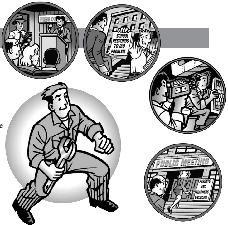
Schools should react to an IAQ crisis quickly and honestly.

Immediately, Saugus Union School District focused on resolving the issue by using EPA’s IAQ TFS Program to guide the gathering of as many facts and environmental data as possible. In addition,