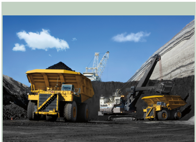
North Antelope Rochelle Mine

These wells are drilled on leases located within the Bureau of Land Management's Conflict Administration Zone (CAZ) Coal and Coalbed Natural Gas South Pod . Each of the three CAZ pods (North, Middle, and South) are based on an expected 10-year mine-out zone around each surface mine where CBM development is already underway or is anticipated. CAZs were established on federal lands in Wyoming as an incentive to accelerate CBM production by encouraging CBM operators to drill wells and extract as much CBM as possible in the time available to allow uninterrupted coal mining operations. CBM wells within CAZs are eligible for a 50 percent royalty rate reduction on CBM production for the life of the well.