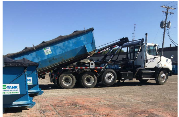
Photo #2: View of tarp covered soil filled roll-off box being dropped at the site until lab results received