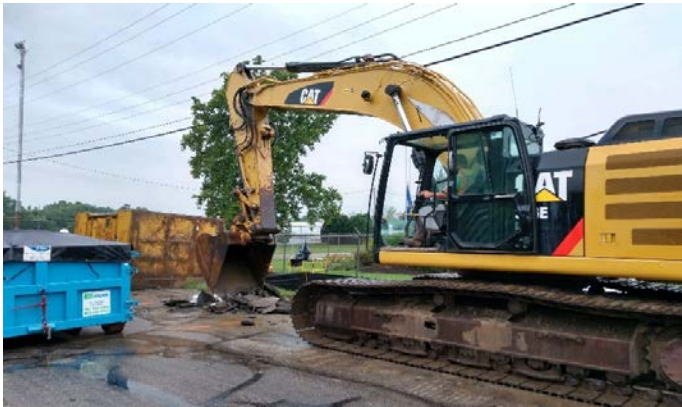
Photo #1: Starting excavation activities at far south end of project area (sewer manhole #250040)