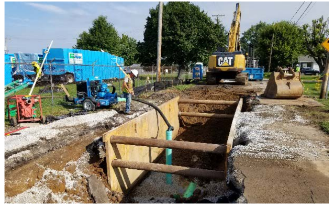
Photo #4: View of dewatering well, blue frac tanks, trench excavation, & new sewer pipe