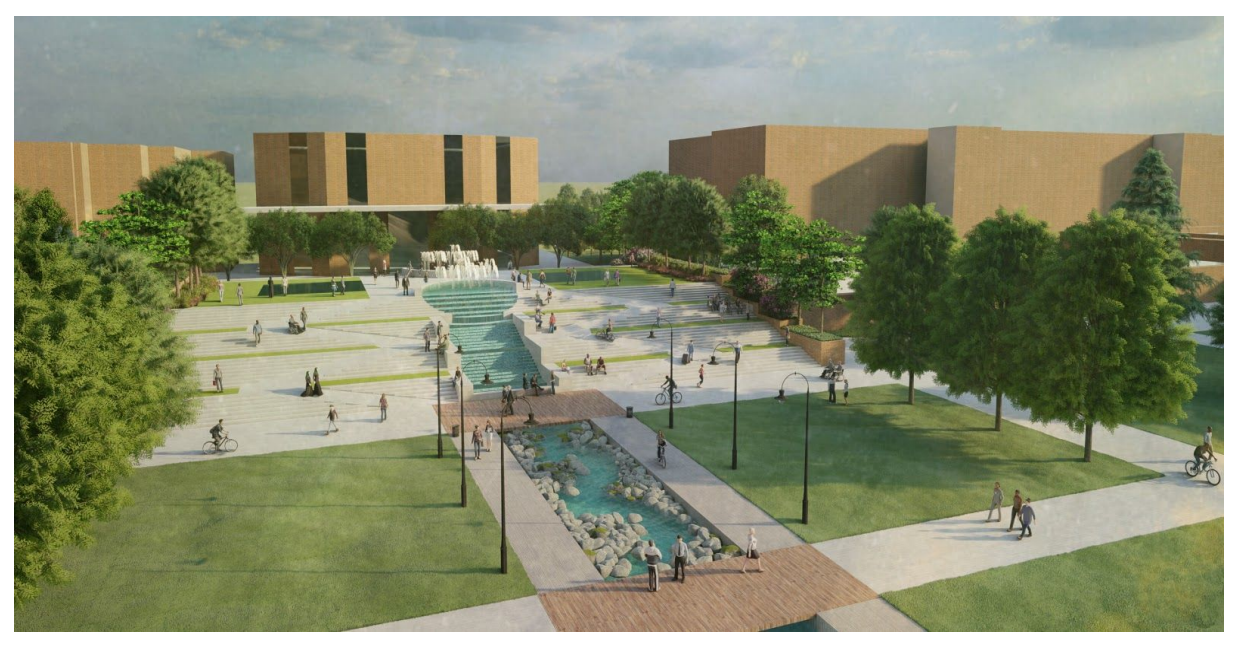
West View into the Deck Park area