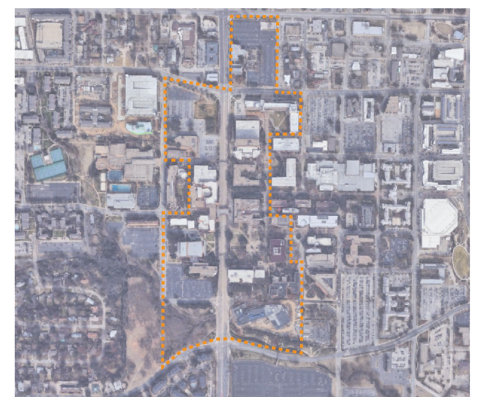
Site Location, Google Earth

Proposed solutions not only have an impact on our campus, but can influence environmental and social systems on a larger scale. UTA has nearly 60,000 students, from 100 different countries, with most students living off-campus, and the Trinity River system provides water for millions of Texas residents and wildlife. Our team seeks to create a safer environment for multi-modal transportation through the campus, mitigate stormwater, pollution, reduce heat-island effects, conserve water and provide an identity of sustainability and diversity for the campus.