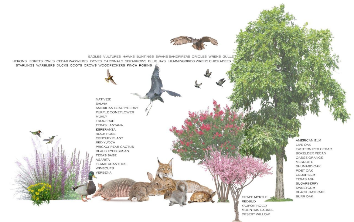
Figure 1.3 Flora and fauna diagram for Arlington, Texas

Arlington plays host to a variety of native and adapted plants, as well as Texas wildlife. Our plan proposes the use of 35 native plants and tree species throughout the more than 27,000 Sq.Ft. of added bioswales. Native plants require less maintenance due to the plants increased resistance to pests and disease and are less likely to be invasive. The use of native plants in our design proposal will also reduce the need for pesticides and fertilizers, and we would propose eliminating the use of these on the UTA campus due to their negative environmental impacts. Native plants also attract and provide refuge for our local, native wildlife. Our proposed plant list for the site was carefully crafted and curated to meet functional, ecological and aesthetic goals. A native and adapted planting palette that provides both an enjoyable experience to pollinators and wildlife, and is fragrant and visually beautiful to human users, helps to create a campus of biodiversity, unity, resiliency, and sustainability, as well as an overall pleasant experience for all users and visitors of UTA.