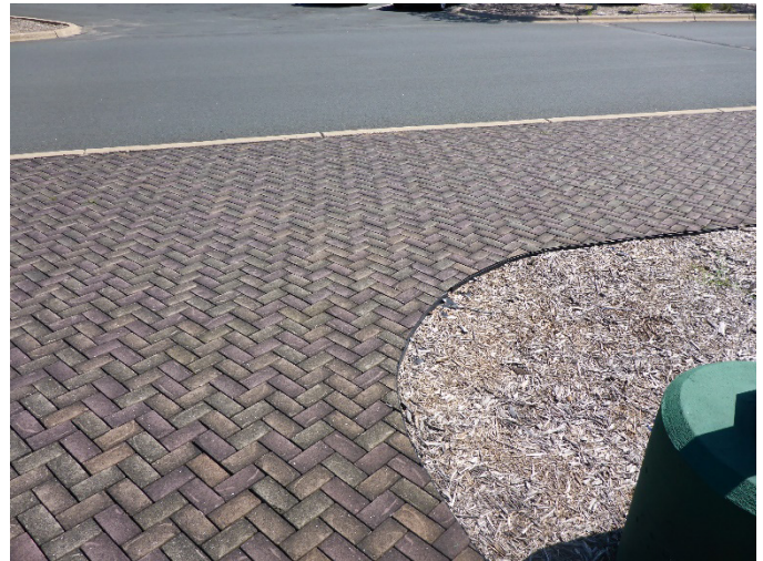
Permeable pavement can reduce the impervious area in an urban landscape without losing the functionality of impervious surfaces.

Permeable pavements can help achieve multiple benefits since they provide surfaces to move vehicular and pedestrian traffic and reduce stormwater discharges. They are suitable for municipal stormwater management programs and private development applications. For municipal applications, permeable pavements can reduce pavement ponding and local flooding by infiltrating stormwater on-site. Similarly, private development projects can use them to meet post-construction stormwater quantity and quality requirements. Permeable pavements can be especially helpful in developed areas with little open space that cannot accommodate post-construction stormwater