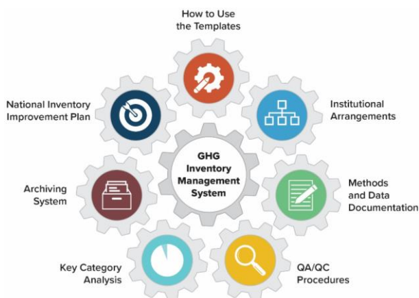
Templates in the Toolkit for Building National GHG Inventory Systems

EPA develops tools and works directly with national inventory teams to help developing countries build institutional and technical capacity for establishing, maintaining, and improving sustainable GHG inventory management systems and producing high-quality inventory reports on a regular basis. This approach builds on over two decades of experience preparing the Inventory of U.S. Greenhouse Gas Emissions and Sinks and lessons learned from working alongside developing country experts.