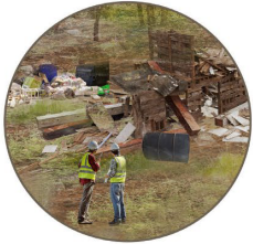
ASSESSING CURRENT SITE/SOIL CONDITIONS