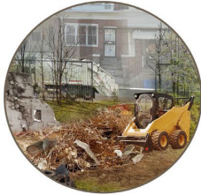
CLEANING SITE - REMOVAL/RECYCLING DEBRIS