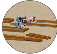
RAISED PLANTING BEDS WITH CLEAN TOPSOIL