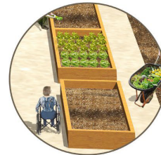
ADA ACCESSIBLE RAISED PLANTING BED