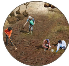
IN GROUND PLANTING BEDS - REMOVAL OF EXISTING SOIL/REPLACED WITH CLEAN TOPSOIL