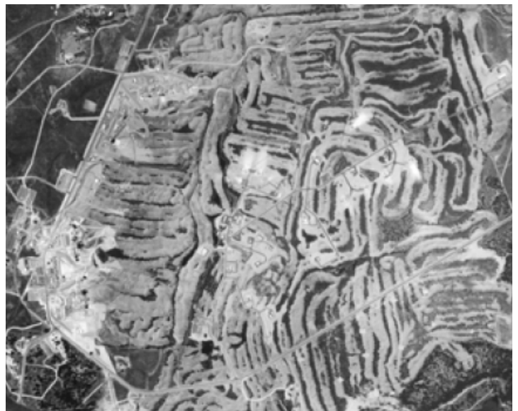
Aerial view of rocket fuel production and testing areas at the Site, 1963.

After 12 years of investigations and site characterization, EPA, the State of California, and Aerojet updated the settlement agreement in 2001. The amended agreement redefined the Site boundary, reducing the Site's size to 5,900 acres, and divided the Site into nine operable units.