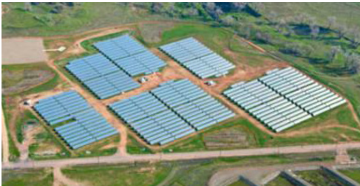
The Site's solar farm is one of the largest single-site industrial installations in the United States.

included the removal of over 35,000 tons of contaminated soil and the installation of a groundwater treatment system. Construction activities for the Area 40 cleanup were completed at the end of November 2020.