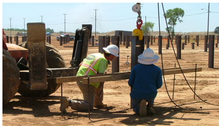
Solar project construction.

"Greener Cleanups" is the practice of considering all environmental effects of remedy implementation and incorporating options to minimize the environmental footprint and maximize the environmental benefits of cleanups. By incorporating the use of renewable energy sources at Aerojet, EPA and its partners are maintaining the effectiveness of remediation methods while reducing greenhouse gas emissions from conventional power sources.