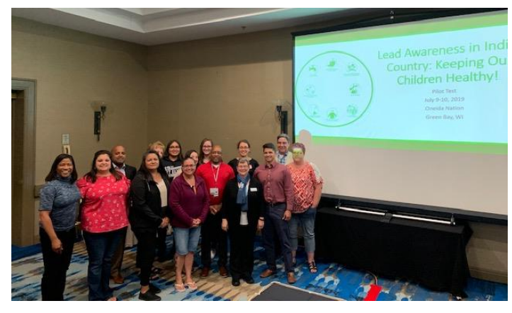
Launching the lead curriculum pilot at the Oneida Nation.

Lead Awareness in Indian Country: Keeping our Children Healthy! was formally published in November, and the TSC supported a virtual roundtable highlighting the curriculum. The TSC, NTTC and OCSPP obtained input from more than 200 Tribal representatives from 80 different Tribes to ensure that the curriculum was Tribally driven and relevant. Since 2020, more than 1,600 individuals have attended sessions devoted to the curriculum, and the entire curriculum has been translated into Spanish, which will allow more communities to take advantage of this valuable resource for Indian country.