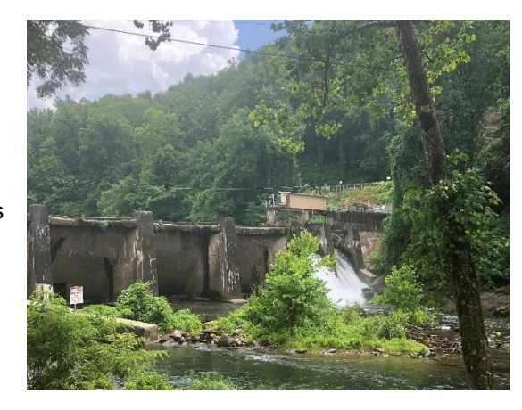
The Ela Dam on the Oconaluftee River near Cherokee, North Carolina.

During the TSC Summer 2022 Face-to-Face Meeting, the group held a robust working session on Tribal knowledge, research protocols and data sovereignty, led by an EBCl researcher and the EPA representative on the White House's Interagency Working Group on Indigenous TEK. Attendees also heard from EBCl researchers working to restore Cherokee natural and cultural resources and received a reservation tour of some of these resources, also visiting the Ela Dam, which the Tribe is working on removing to help restore fish habitat.