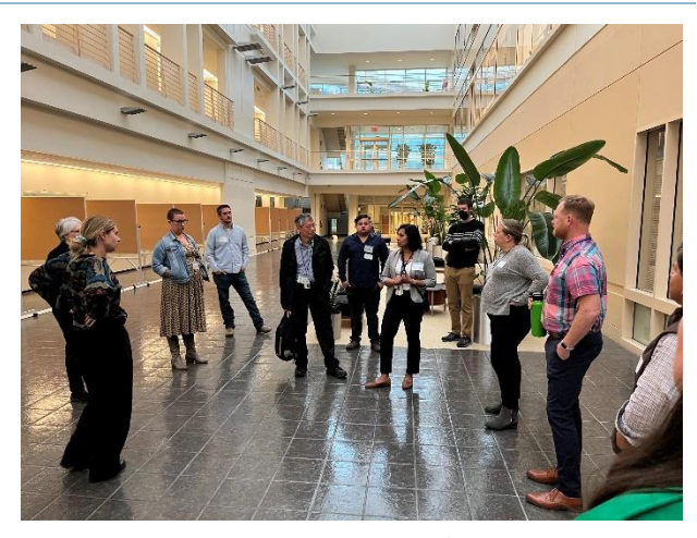
TSC members receive a tour of EPA's Research Triangle Park facility in North Carolina.

The TSC continued its theme of reconnecting during the TSC Fall 2022 Face-to-Face Meeting at EPA's facility in Research Triangle Park, North Carolina. The theme was "Science Connectedness and Collaboration: Walking the Path Together." The TSC's Tribal Caucus conducted a "Tribal Civics 101: Understanding the Tribal–Federal Relationship" session to educate EPA staff about the historical and legal basis for inherent sovereignty, Tribal consultation and engaging with Tribes. The TSC also engaged in a working session devoted to co-production of research that focused on what co-production looks like from a Tribal perspective, including protection of Tribal knowledge. Presentations, tours and discussions at the meeting advanced the TSC's understanding of key science