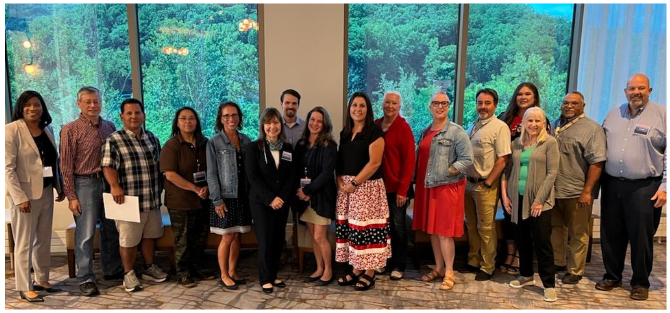
TSC members in June 2022 at the Eastern Band of Cherokee Indians in Cherokee, North Carolina.

One of the important ways that EPA accomplishes its objective of strengthening relationships with Tribes is through constructive dialogues and priority setting between EPA and Tribes through the various EPA-Tribal Partnership Groups, including the TSC. In May 1999, under the auspices of 1984's EPA Policy for the Administration of Environmental Programs on Indian Reservations (commonly known as the 1984 EPA Indian Policy) and at the request of the National Tribal Caucus, the Office of Research and Development (ORD) Assistant Administrator called for the formation of a "Tribal Science Council" to provide a forum for interaction between Tribal and EPA representatives to work collaboratively on environmental science issues. The TSC is a partnership between EPA and Tribal Nations that seeks to increase Tribal involvement in EPA's scientific activities—building bridges between Tribal and EPA programs by focusing on priority Tribal science issues. The Council comprises EPA Representatives from program offices and regions, a Tribal Representative from each region, and a Tribal Representative of the Alaska Native communities.