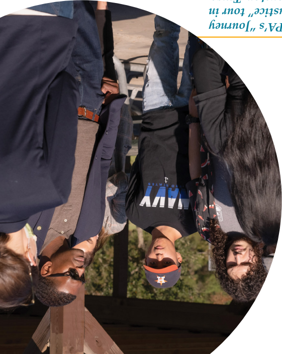
EPA's "Journey to Justice" tour in Houston, Texas.