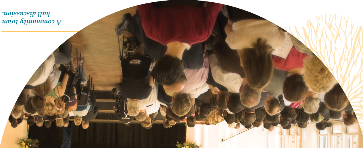
A community town hall discussion.