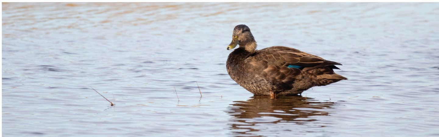
American black duck