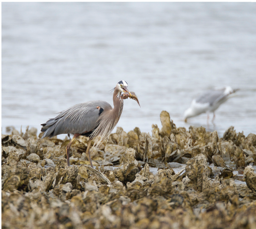
Blue heron on an oyster bed