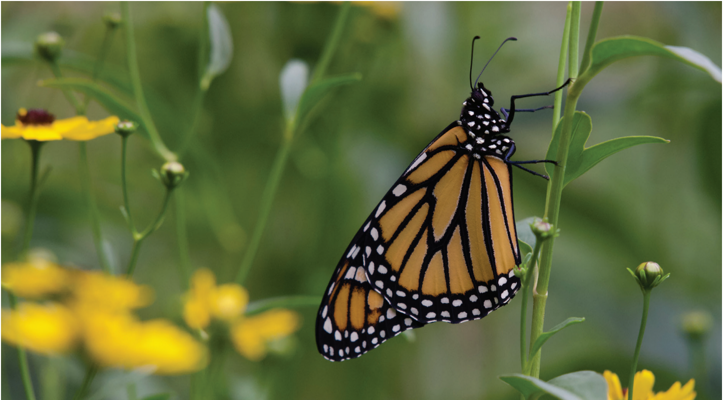
Monarch butterfly in Northern Virginia