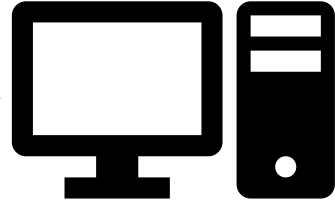
Company hazardous waste software with access to Remote Signer API credentials