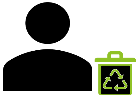
Unregistered field personnel