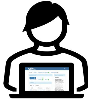
Registered Remote Signer